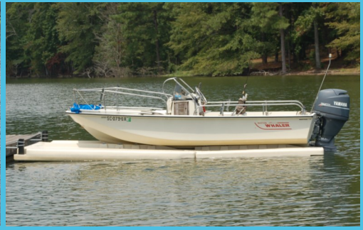
Our drive on boat docks are easy parking and launching in shallow water.