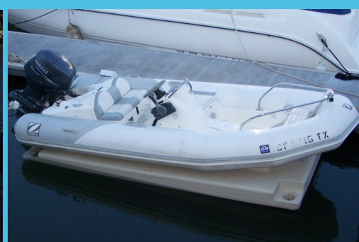
Customize Jet-Port products to meet your needs. You can link multiple boat docks together.