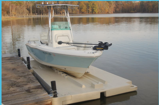
A variety of docking options— Front Mount Attachment, Side Attachment or Fixed Dock Installation.