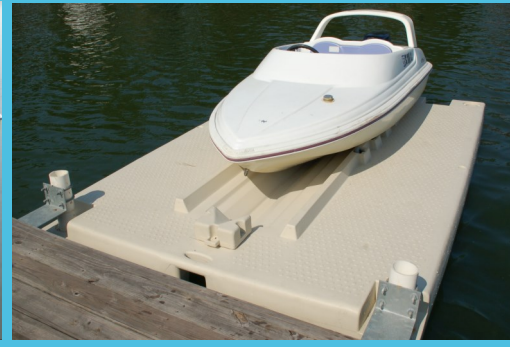
dd extra storage and walk room by adding a front extension to the Glide-N-Ride, Roll-N-Ride & XL Product