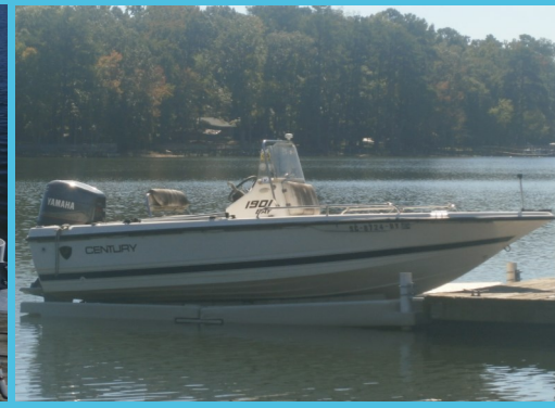
Easy to install and remove.