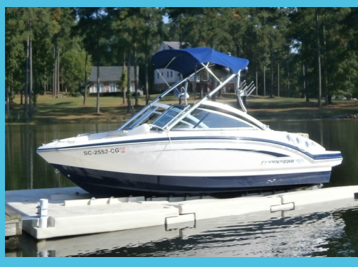
11' wide docks allow walk around room. Great for boat maintenance such as flushing, cleaning, or refueling