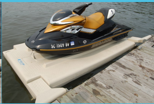
A variety of docking options— Front Mount Attachment, Side Attachment or Fixed Dock Installation