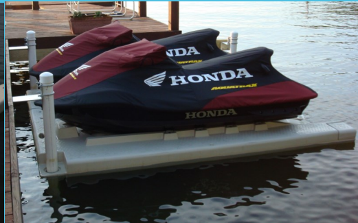
Add extra storage and walk room by adding a front extension to the Glide-N-Ride, Roll-N-Ride & XL Products