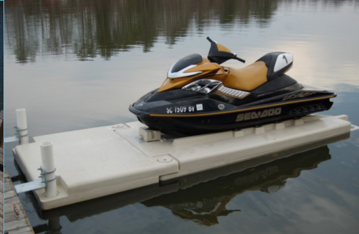
Customize Jet-Port products to meet your needs. Combine the Glide-N-Ride® and Roll-N-Ride into one docking system. Even include an extra wing attachment for more walk-around room!