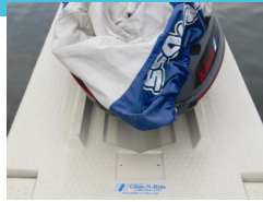
Cover Your Investment