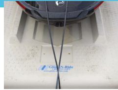
Secure Your Watercraft